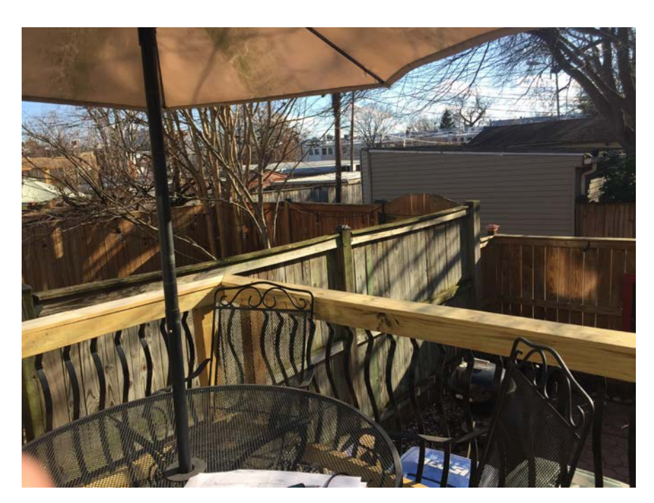
VIEW FROM EXISTING DECK, LOOKING EAST